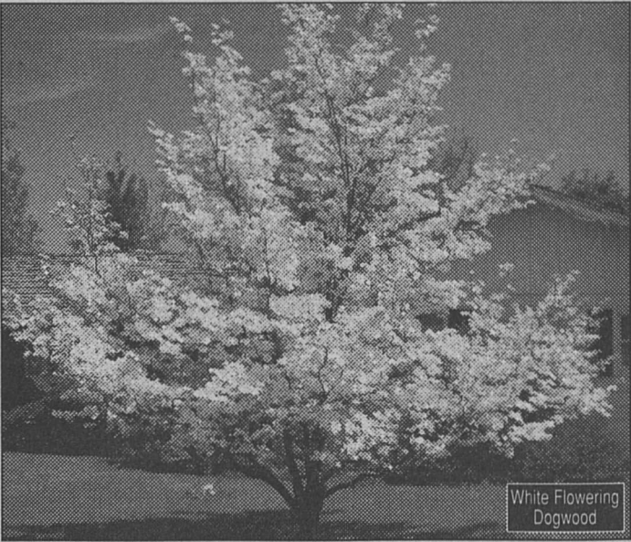
White Flowering Dogwood